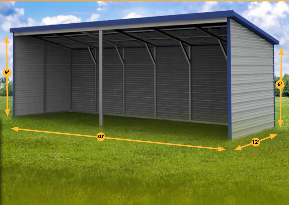
Example shown is 30'x12'x9'x6'