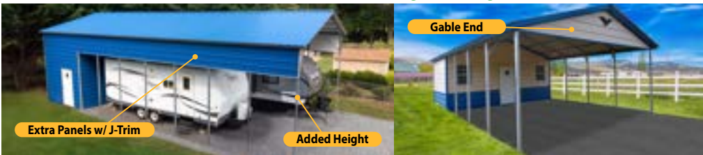
Examples shown feature additional options not included in base price.

Add $200 for additional 5' of storage with 9' Legs