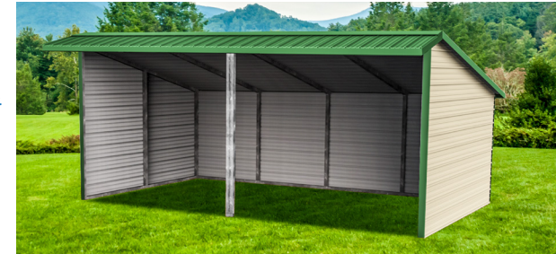
Example shown features additional options not included in base price.

Please note, side to side on level lots will result in gap underneath garage doors.