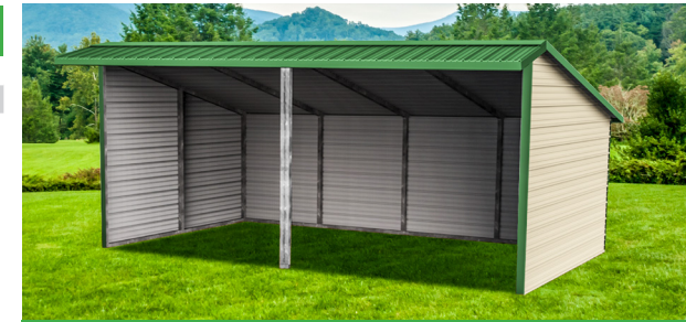
Example shown features additional options not included in base price.

All stated dimensions are in reference to the frame size, not the roof dimensions. All cement pads require 2" wider on all sides. Ex. 20' wide x 30' long unit will need a 20'4" wide x 30'4" long pad.