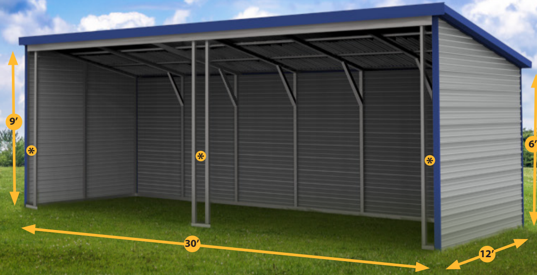
Example shown is 30'x12'x9'x6'

PLEASE NOTE LOAFING SHEDS FRAME-OUT DESIGN HAS SLIGHTLY CHANGED. *NOW 12" WIDE.